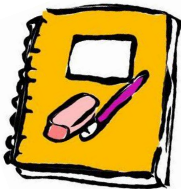
a copy book or a note book